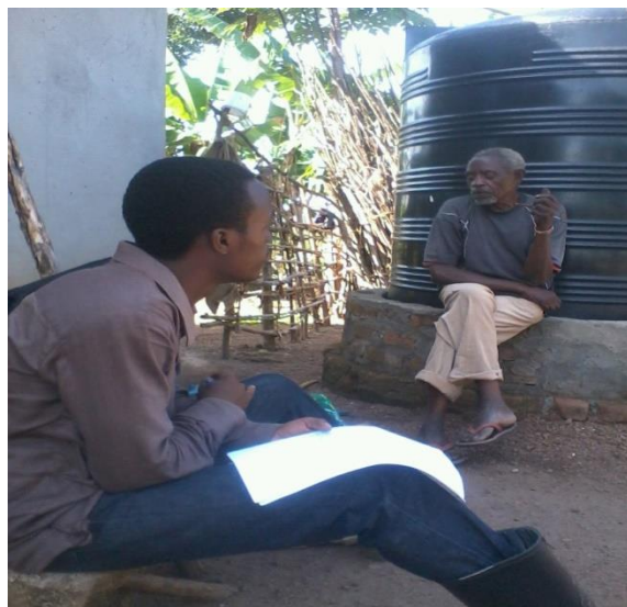
Figure 1: During the field surveys