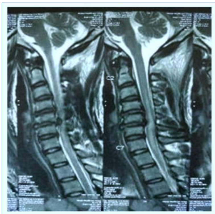
Fig-2: Magnetic resonance imaging cervical spine, mid-sagittal images with normal imaging on T1 and hyperintense on T2-weighted sequences, which was considered as edema group.