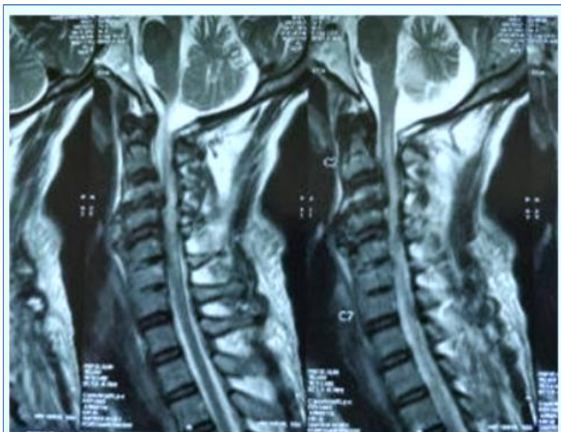
Fig-1: Magnetic resonance imaging cervical spine, mid-sagittal images showing a subluxation at C5/C6 level with normal images on T1 and central hypointensity with peripheral hyperintensity on T2-weighted, which was considered in contusion group