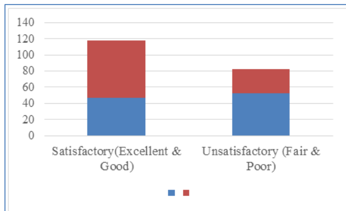
Fig-4: Comparative evaluation outcome at 6 week and at 12 month (n = 17).

months. However, the difference in improvement between 6 weeks and 12 months did not turn to significant probably due small sample size (p = 0.219) (Fig. 4).