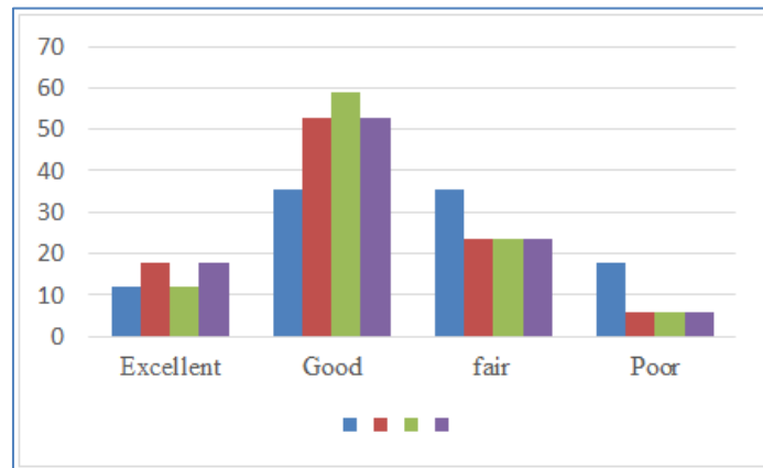
Fig-3: Outcome evaluation by Harris Hip score (HHS)

excellent outcome was 17.6% and good 52.9%, while at 6 month excellent was 11.8% and good 58.8%. The outcome at 12 week and that at 12 months did not differ (Fig.3).