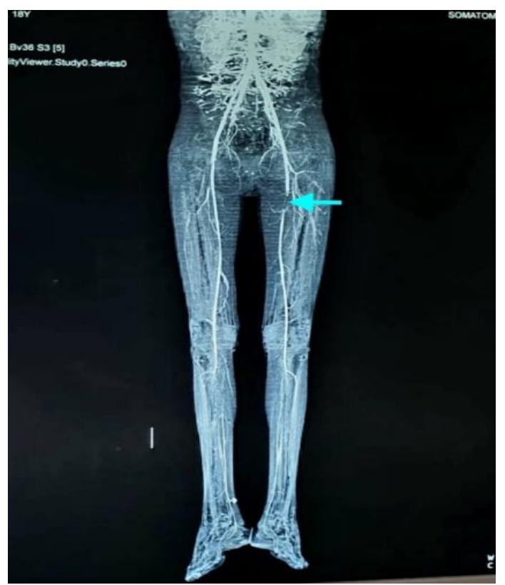
Figure 1: Aortic-lower extremity angiogram: occlusion of the left SFA

on the 4th postoperative day of septic shock despite an effective antibiotic therapy and resuscitation measures.