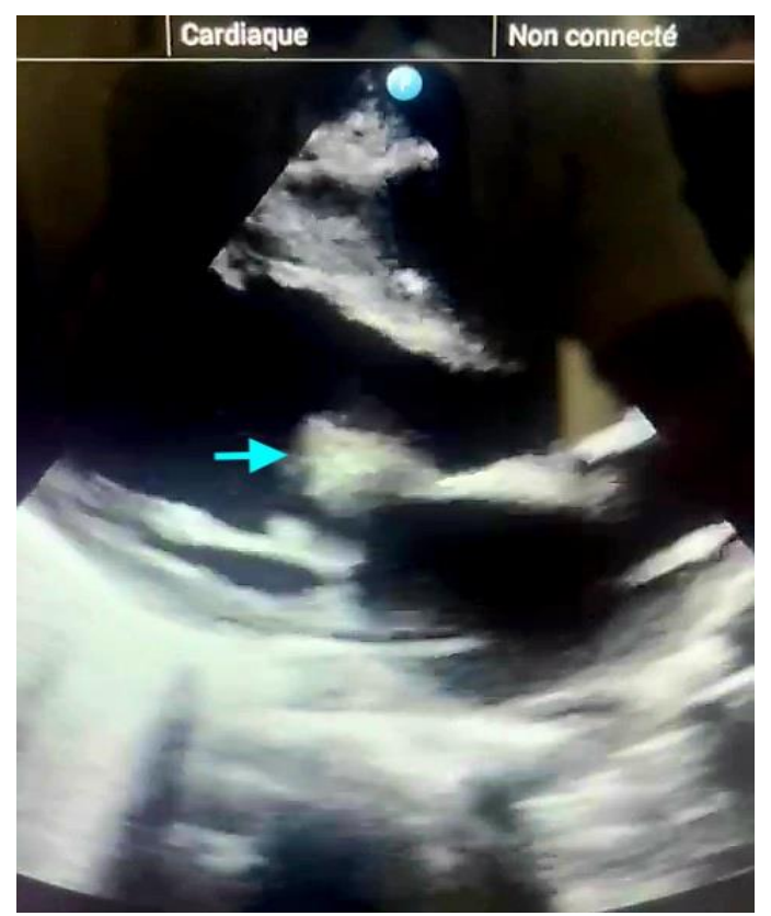
Figure 2: Vegetation on the mitral valve on transthoracic echocardiogram (TTE)