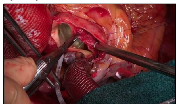
Figure 1: Intraoperative photograph shows an aortic dissection that intimal flap in ascending aorta.