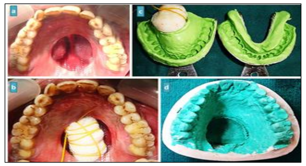
Figure 1: (a) Perforated hard palate (b) Clinical block using a sterile threaded gauze piece (c) Preliminary impressions of maxillary and mandibular arches (d) Diagnostic cast

problems with his colleagues and his family members since he was not able to pronounce properly. Extra oral examination was noncontributory. Intra oral examination revealed an intact natural dentition in both arches. The maxillary hard palate was perforated ( Fig 1 a) the size of which was roughly 30 mm in length and 24 mm in width that extended to and over the soft palate region. There was no hard palate bone continuity in the posterior palatal region. The patient was presented with a treatment plan of rehabilitation