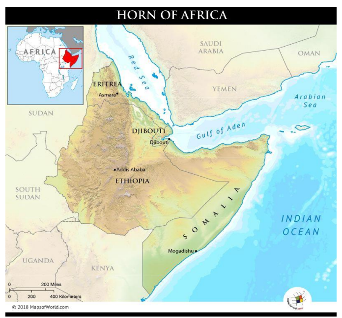
Map-2: Horn of Africa Region