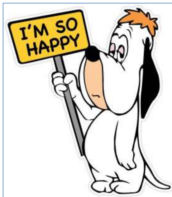
Fig-1: Droopy Dog with its iconic quote.

People think that I am the world mastermind and therefore all the people try to make mental disorder for me. I want to tell that I am not the mastermind of the world and I will not become so. Therefore, according to the principles of DEPRESSIVE REALISM, I must get happy.