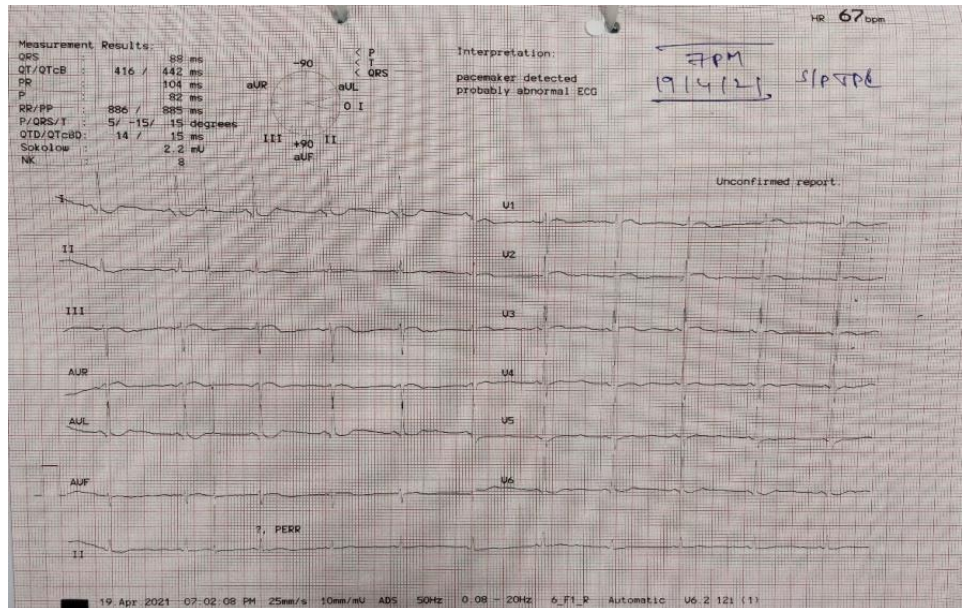
Figure-2: ECG showing intrinsic rhythm after 48 hrs

During her ICU stay, metabolic acidosis was corrected with bicarbonate supplementation. Hypokalemia was corrected with Inj. Potassium chloride (KCl) and Inj. Magnesium sulfate (MgSO<sub>4</sub>).