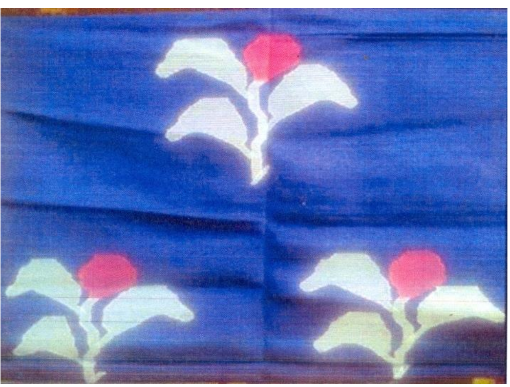
Decoration or design on the hand woven-cloths in Ebira land.