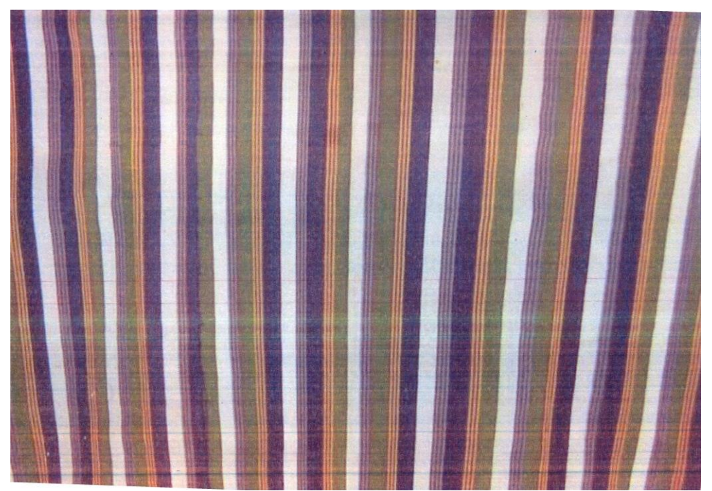
Cloths for general use by both male and female