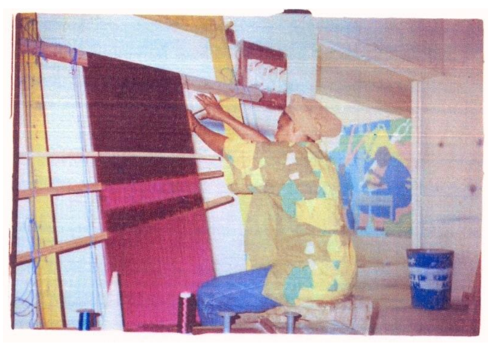
The warping process on the vertical loom (rolling thread on the loom) in Kogi Central