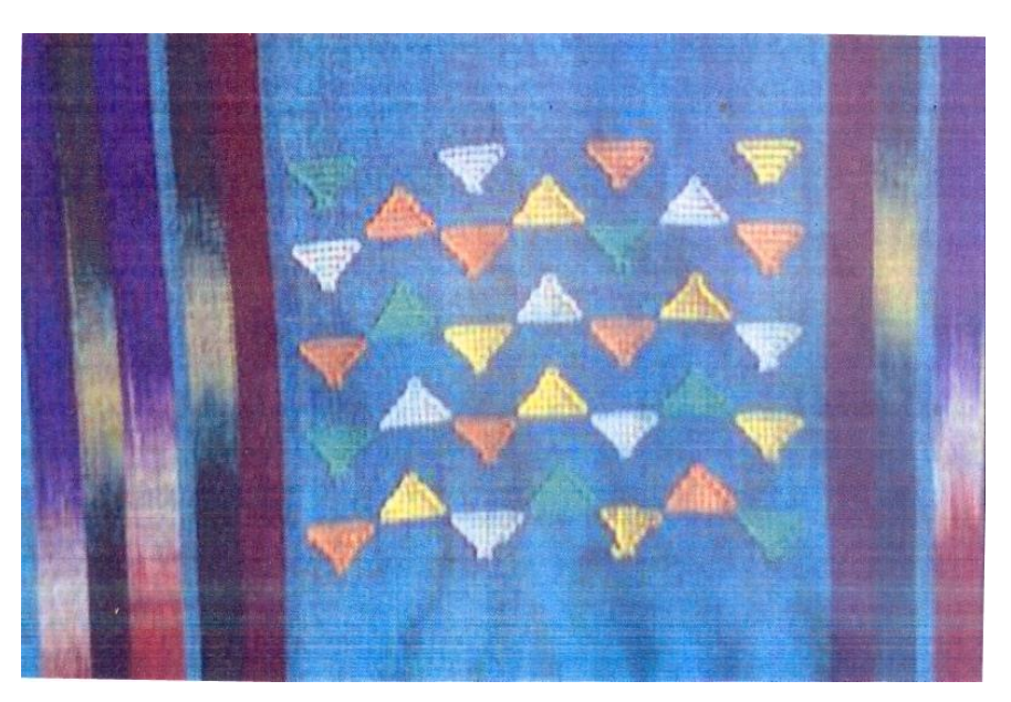
Decoration or design on hand-woven cloths

Motifs used in the decoration of handwoven cloths of the Ebira commonly drawn from representational objects like bird, animal, house-hold items such as stool, comb, and plant. Geometric motif is peculiar to decorated cloth of the Ebira, also in many cases, once a motif is woven into decorative pattern and found to be good, other cloth weaves would adopt the pattern and becomes additional design type in the cloth weaving of the people.