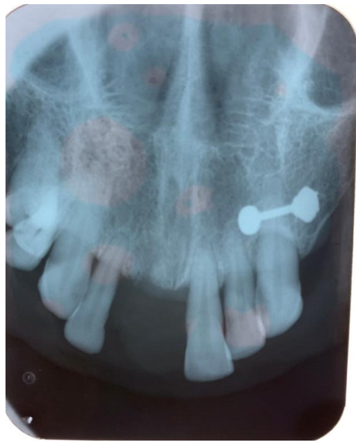
Fig-3: Occlusal radiograph showed missing #11 teeth and no involvement of the underlying bone was detected