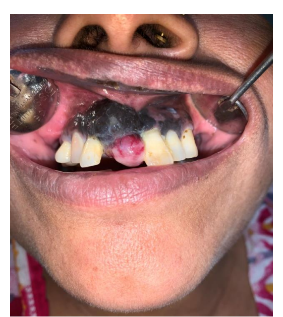
Fig-2: A nodular swelling measuring about 1×3 cm on the labial mucosa extending from 12 to 21 with a sessile base and single round nodular growth was present over the crestal region of the edentulous region of 11 teeth.