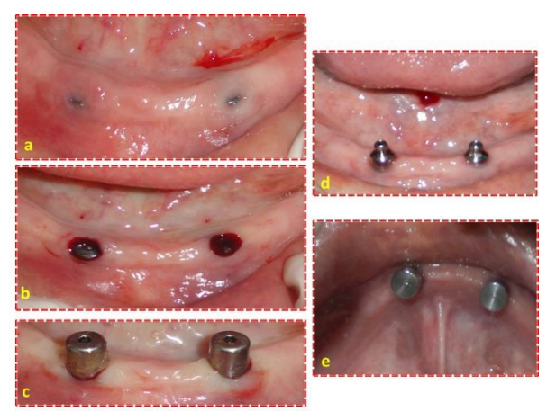
Figure 2: (a) Stage 2 surgery showing location of implants (b) punch tissue removal (c) healing cap (d) abutment placement (e) healing cap placement

Figure 1: (a) Orthopantomograph showing resorbed mandibular ridge (b) and (c) CBCT analysis and probable location of the implants (d) CBCT showing an occlusal analysis of the ridge to determine the width of the implant