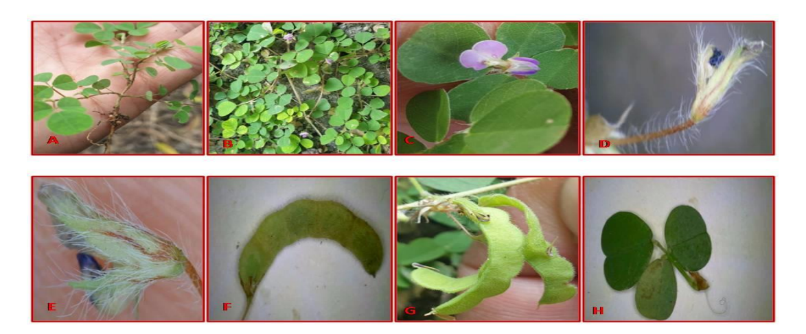
Figure 2: Some original photographs from A-H taken during collection (Desmodium triflorum )