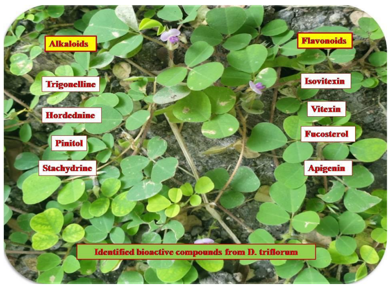
Figure 3: The phytoconstituents found in Desmodium triflorum are depicted in the schematic diagram

as pinitol and flavonoids such as diholosyl flavones, 2-oglucosylvitexin, vitexin, isovitexin, and apigenin.