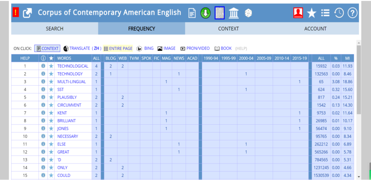
Figure 2: The corpus "breakthrough" word frequency collocation retrieval resources

Corpus "breakthrough" word frequency collocation retrieval, Corpus of Contemporary