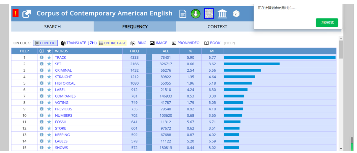
Figure 1: The corpus "record" word frequency collocation retrieval resources

Corpus "record" word frequency collocation retrieval, Corpus of Contemporary American English