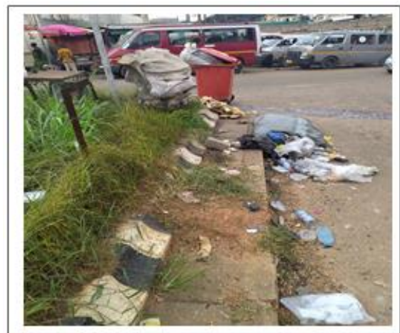
Fig-3: Typical scene of road-side in Kumasi

The results depicted here generally reflect respondents' views on their involvement in MSW management and their views on solutions to waste management issues in Kumasi. These are preceded by a summary of the site visits and field observations made by the researchers, which revealed the magnitude and impact of improperly managed MSW. Site visits to the Central Business District (CBD) and along some principal streets in the Kumasi metropolis established that indiscriminate dumping on the streets, in drains and in open spaces was very prevalent. The photographs depict wastes overflowing their containers (Figures 3 and 4). These uncovered wastes attract flies and rodents and also generate offensive odors.