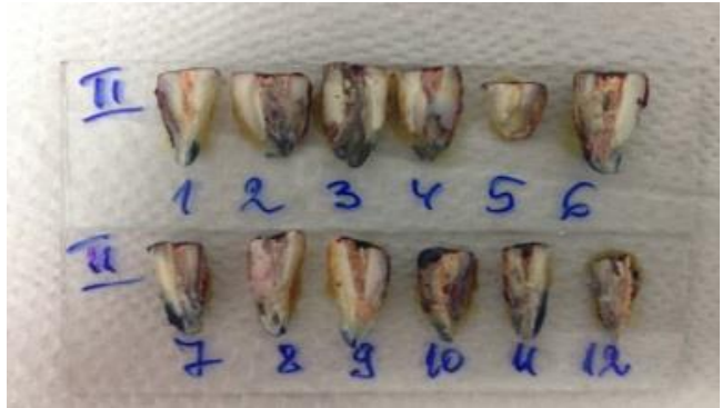
Fig-3: Experimental specimens

Statistical analysis was done with SPSS 19.0 statistical software package, using Mann-Whitney and Kruskal-Wallis Tests and p value <0.05 was considered as significant value.