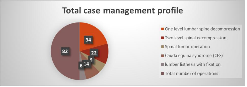
Fig-1: Total case management profile.

Above 82 patients half assigned to general Anaesthesia and the other half to balanced Anaesthesia. Fewer episodes of tachycardia, hypertension, and better postoperative pain with less analgesic requirement in the balanced anesthetic procedure. There were 45 males and 37 women, ranging in age from 34 to 72. The