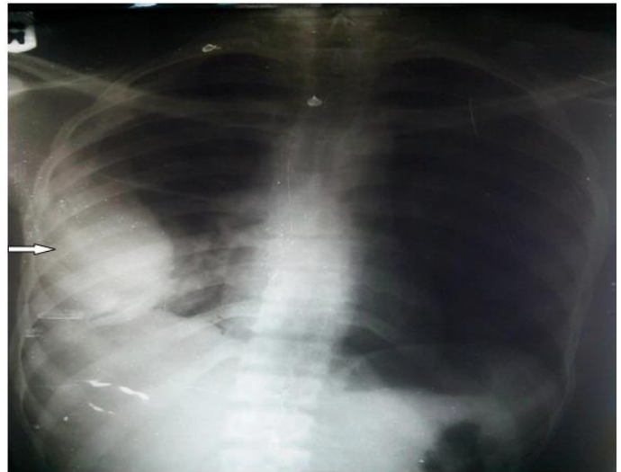
Fig-1: Chest radiograph postero-anterior view showing a homogenous opacity in the lateral aspect of the right hemithorax with convex border medially and making an obtuse angle to the lung parenchymal (arrow). The opacity is obliterating the lateral 2/3 of the right hemidiaphragm. Note the adjacent patchy parenchymal lung opacities as well

Post-operative period was uneventful. The post-operative chest radiograph showed clearance of the loculated pleural effusion. There were patchy opacities in the right lung fields presumably due to post-surgical pulmonary changes. Chest tube was noted in situ. He was placed on anti-TB drugs and discharged one week later. He remained asymptomatic on routine follow up for up to two months.