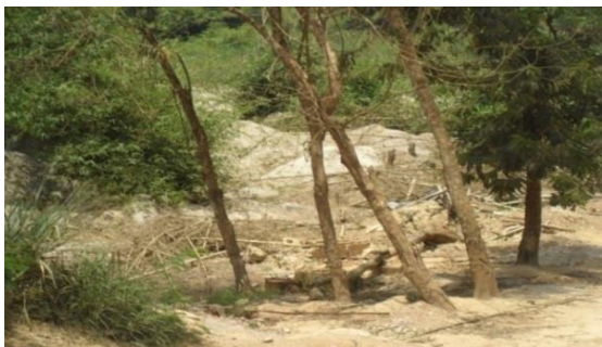
Plate-6: Land Degraded at Manhya