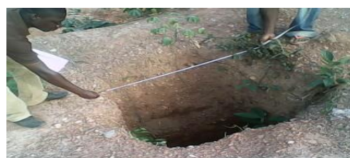
Plate-4: Open-pit created at Esaase