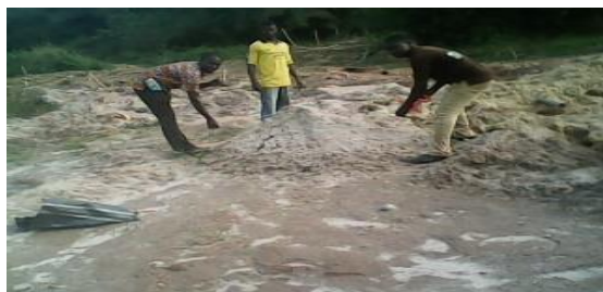
Plate-5: Heaped Laterites at Mpatuam