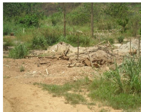
Plate-1: A mining site at Manhyia

An overview of illegal mining sites in some of the communities showing Species diversity is shown in Plates 1 and 2.