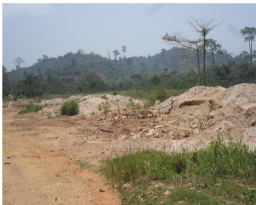
Plate-2: A mining site at Mpatuam