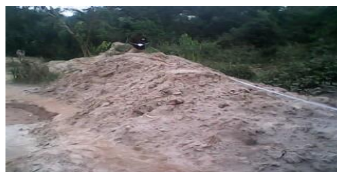
Plate-3: Heaped Laterites at Aboabo

In addition, it was observed that pits and trenches were created which eventually rendered such areas inaccessible to the people, while making it dangerous to wildlife. Depths of some pits observed ranged from about 10m-20m deep. Even where such pits were backfilled, they were rather covered with rocks and gravels. These could render the land infertile for plant growth and unsafe for agricultural purposes. Plates 3, 4, 5, and 6 show the degradation of land caused by the activities of Illegal mining in the study areas.