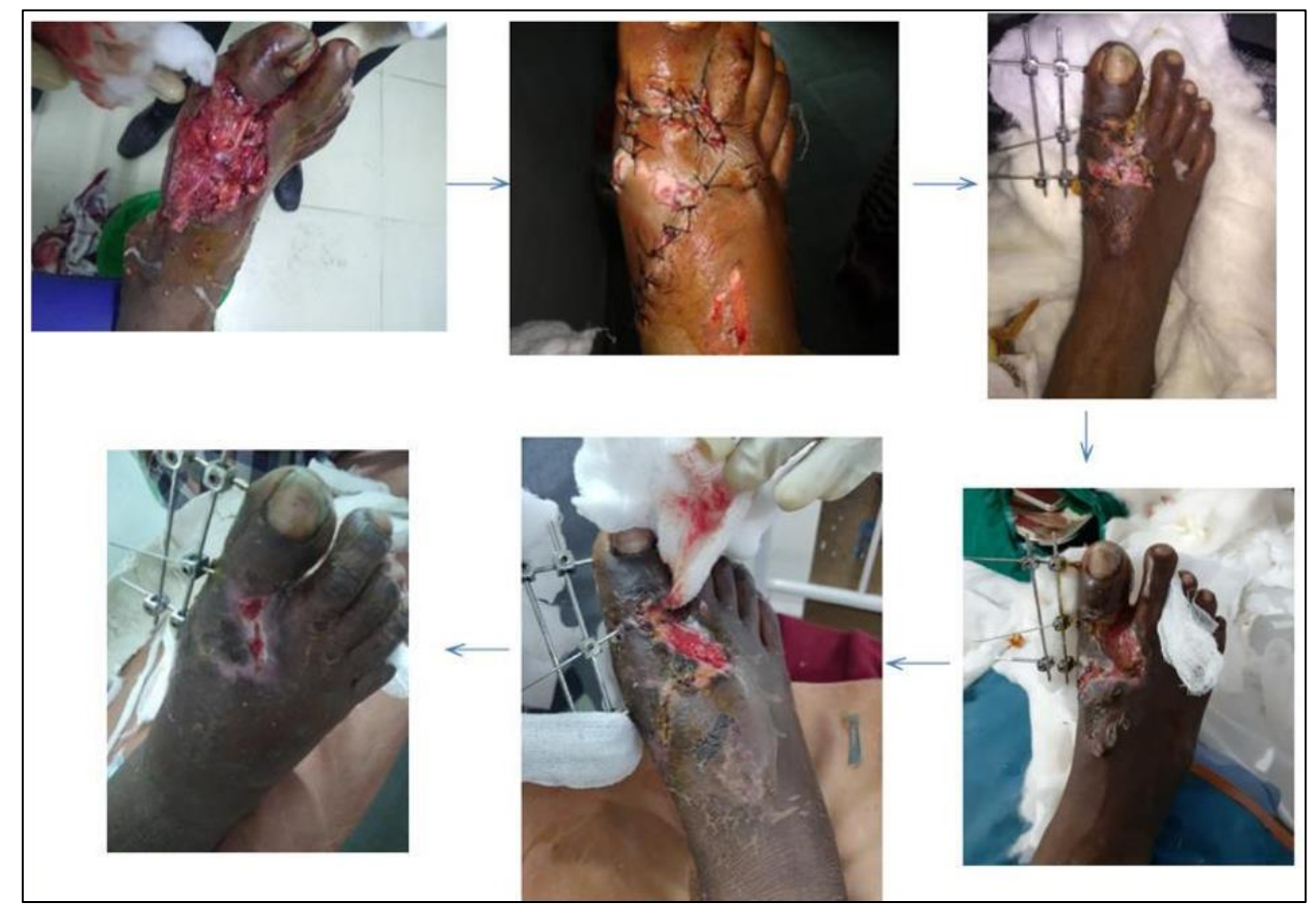
Figure 4: Pictures of wound healing using honey and ghee among study population

8.9 days. Applying t test p value was 0.003, which shows statistical significance.