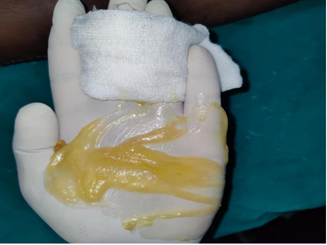
Figure 1: Preparation of honey and ghee mixture for dressing

10 cases regular dressing was done. Sampling method for a duration of 4 months (May 2023 to August 2023) Inclusion criteria:1 Patient coming to VVP RMC LONI with compound fractures 2 Patient admitted with chronic infected wounds 3 Patient consenting for the study. Exclusion criteria: 1 Associated vascular injury 2 Patient not consenting for the study 3 Patient lost to follow up Honey and ghee were taken from a fresh sealed box in 50:50 portion according to size of wound and mixed well then it was applied on the wound directly and covered with gauge and, the dressing was changed is cleaned with sterile normal saline as compared to normal dressing materials ie betadin, povidon iodine ointment, spirit. All Patients data was collected and compiled in Microsoft excel and were statistically analysed using appropriate statistical test using SPSS software.