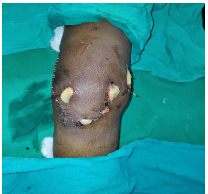
Figure 2: Application of mixture to the wound